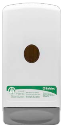
2510037 Manual Dispenser