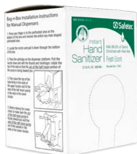
17360 Manual Dispenser Refill