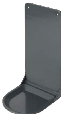
2510122 Drip Tray