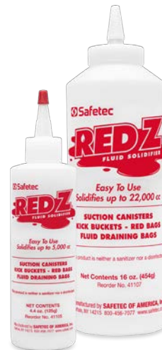
41105 & 41107 Red Z® Bottles Shown