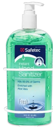
2510101 Wall-Mount Bracket, shown with 17354