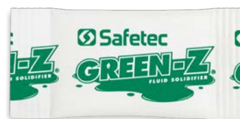
42031 Zafety Pac Shown

Help reduce handling, shipping, and compliance risks of diagnostic specimens, infectious substances, and dangerous goods by using superabsorbent Zafety Pacs. These lightweight pre-measured (single-use) small solidifier pacs provide unique absorption and encapsulation properties ideal for safe compliant packaging and specimen transportation.