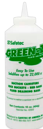
42003 Green-Z® Bottle Shown