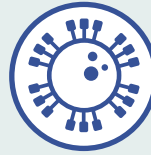
Flu Influenza A