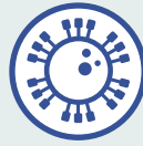
Flu Influenza A