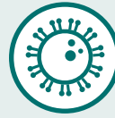
RSV Respiratory Syncytial Virus