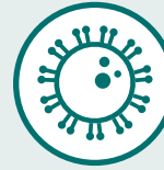
RSV Respiratory Syncytial Virus