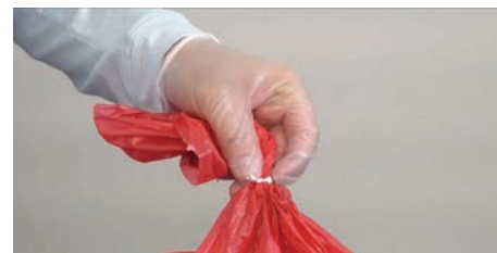
Step 5: Twist Tie

Step 4: Place gelled material along with Scoop/Scraper into Red Biohazard Bag.