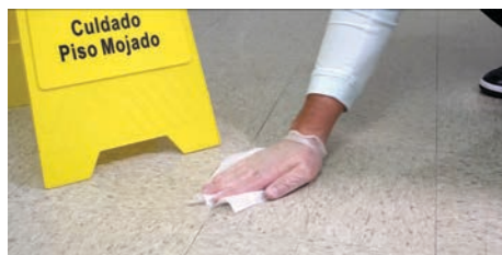
Step 6: SaniZide Pro 1® Wipe

Step 5: Use Twist Tie to securely close the Red Biohazard Bag. Dispose according to local, state, and federal regulations.