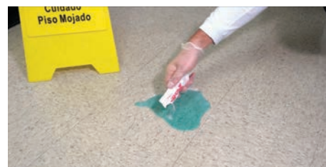
Step 2: Red Z® Solidifier Pouch

Step 2: Sprinkle 10 g Red Z® Solidifier over the spill. Allow liquid to congeal for safer handling and transport.