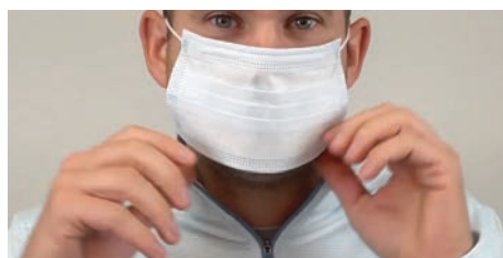
Step 1: Mask & Gloves

Scan here to view the instruction video!