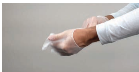
Step 1: Mask & Gloves