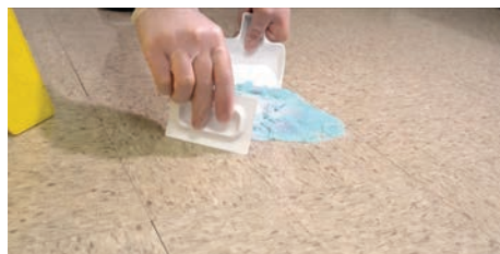
Step 3: Scoop & Scraper

Step 2: Sprinkle 10 g Red Z® Solidifier over the spill. Allow liquid to congeal for safer handling and transport.