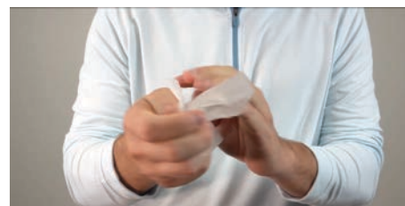
Step 8: p.a.w.s.® Antimicrobial Hand Wipe

Step 7: Remove gloves and mask. Place all contaminated materials into White Disposal Bag and use Twist Tie to securely close.