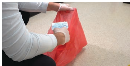
Step 4: Red Biohazard Bag

Step 3: Collect and remove gelled material with Scoop/Scraper.