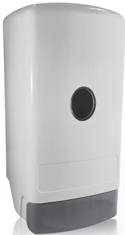
Manual Dispenser (Hand Sanitizer & Soap) 2510037

Safetec offers a Manual Dispenser for Instant Hand Sanitizer; and a Manual Dispenser for SaniWash Antimicrobial Hand Soap.