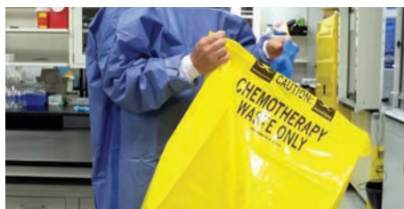
Step 8: Yellow Waste Bag

Step 7: Wipe up any residue left behind with Wiper Pads.