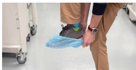
Step 1: Shoe Covers

Scan here to view the instruction video!