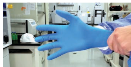
Step 3: Gloves

Step 2: Put on <USP> 800 Compliant Gown.