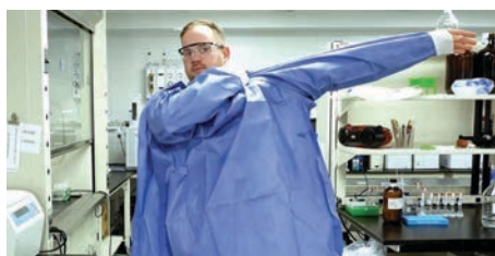
Step 2: Gown

Step 2: Put on <USP> 800 Compliant Gown.