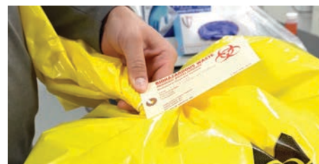
Step 9: Identification Tag & Twist Tie

Step 8: Place hazardous materials along with Shoe Covers, Gown, Gloves, and Face Shield into Yellow Waste Bag.