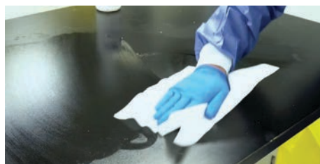
Step 7: Wiper Pads

Step 6: Collect and remove gelled material with Scoop/Scraper.