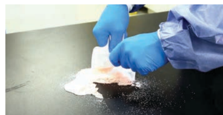
Step 6: Scoop & Scraper

Step 5: Sprinkle 21 g Green-Z® Solidifier over the spill. Allow liquid to congeal for safer handling and transport.