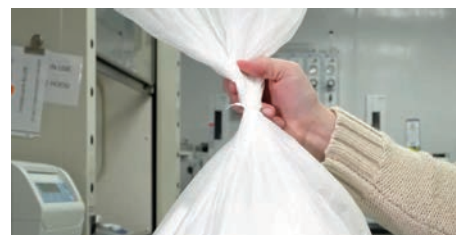
Step 9: Twist Tie

Step 8: Place hazardous materials along with Respirator, Protective Gown, Vented Goggles, and Nitrile Gloves into Clear Disposable Bag.