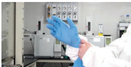
Step 4: Gloves