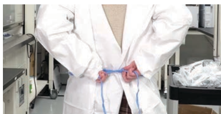
Step 2: Gown