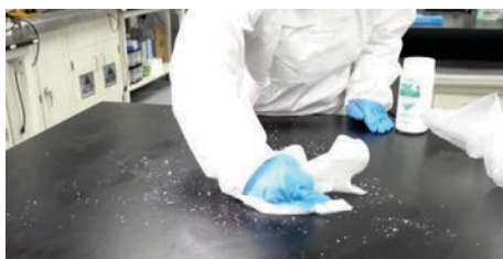
Step 7: Wiper Pads

Step 6: Collect and remove gelled material with Scoop/Scraper.