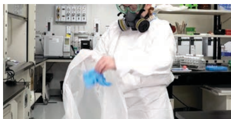
Step 8: Clear Disposal Bag

Step 7: Wipe up any residue left behind with Wiper Pads.