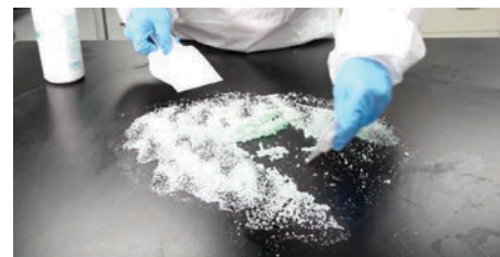
Step 6: Scoop & Scraper

Step 5: Sprinkle 11 oz. FSC 1 Solidifier over the spill. Allow liquid to congeal for safer handling and transport.