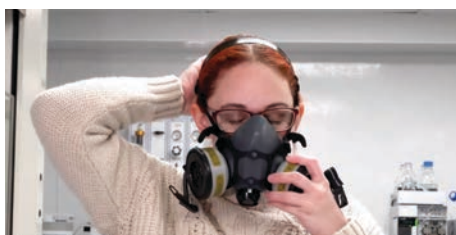
Step 1: Respirator

Scan here to view the instruction video!