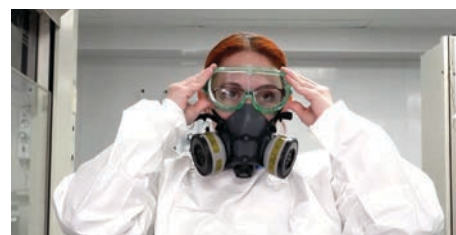
Step 3: Goggles