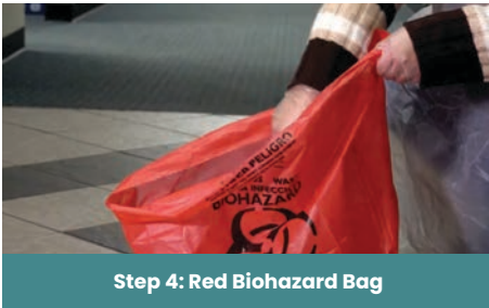
Step 4: Red Biohazard Bag

Step 4: Place hazardous materials along with the Protective Gown, Full Face Safety Shield, and Vinyl Gloves into the Red Biohazard Bag.