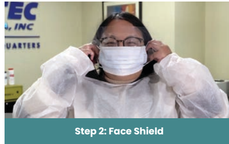
Step 2: Face Shield