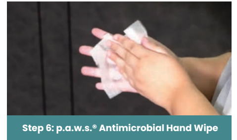
Step 6: p.a.w.s.® Antimicrobial Hand Wipe

Step 5: Use Twist Tie to securely close Red Biohazard Bag. Dispose according to local, state, and federal regulations.